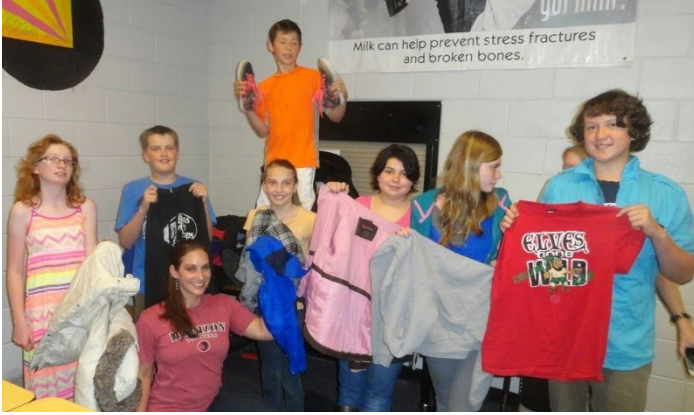
OI Award JOOI Club members first place award for Fighting for Fosters project.

We've all heard the expression, "Go big or go home." Well, the young Optimists at Colorado Springs' Horizon Middle School decided to "go big" — in the first year of their JOOI Club's existence, no less!