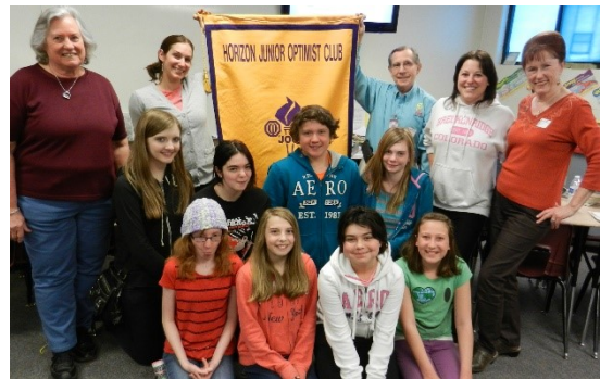
Above are the Horizon Junior Optimist charter members who came up with this project, along with their mentors.