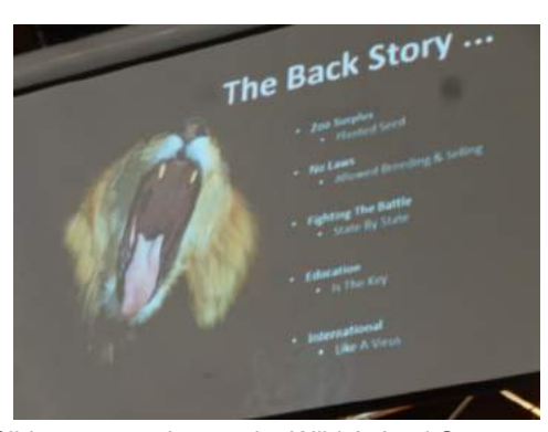
Slide presentation on the Wild Animal Sanctuary