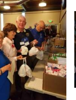
Dental products donated by Delta Dental