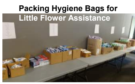
Everything was donated.....