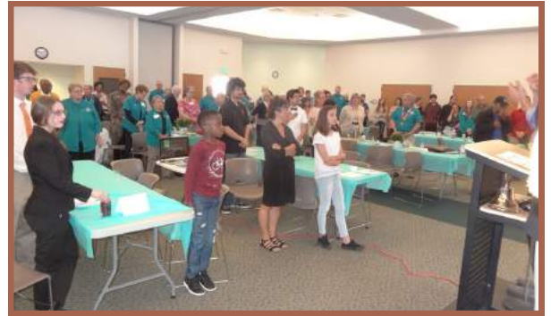
89 Optimists and Oratorical & CCDHH contestants