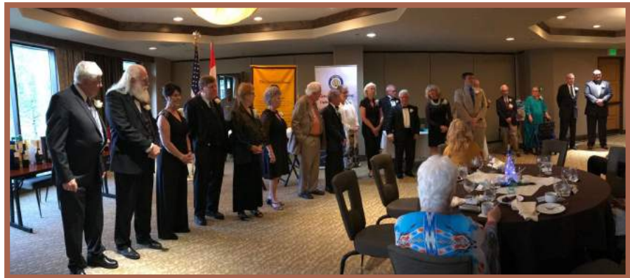
2018-19 Officers and Lt Govs for Installation