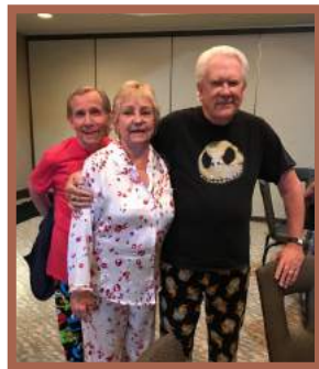
Pease's & photobomber