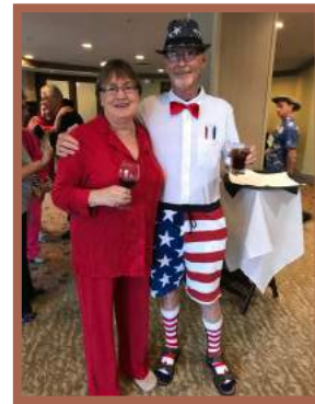
Friday Night Pajama Party