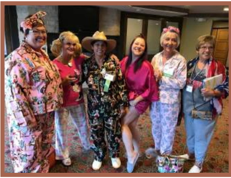
Cheyenne OC members at PJ Party