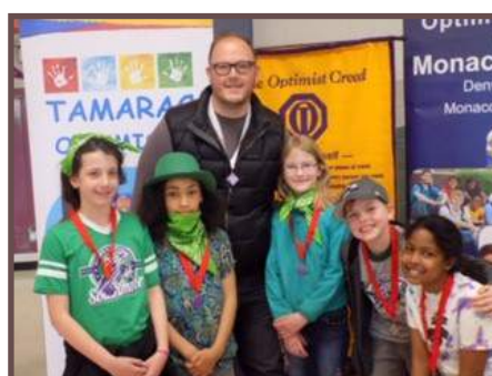
2nd Place Mockingjays from Southmoor