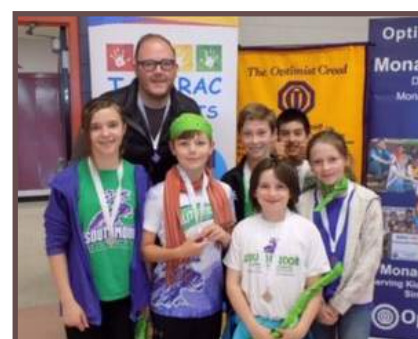
3rd place The Hunger Games From Southmoor