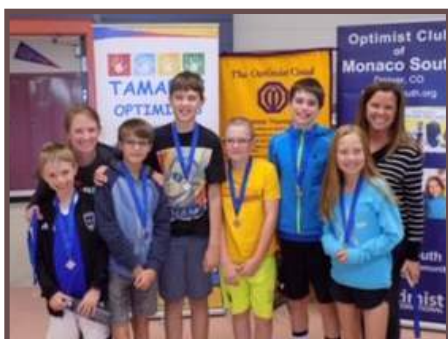
1st place Muppets That Fall On Their Sword from Slavens

Congratulations to The Hunger Games, Southmoor in 3rd place; The Mockingjays, Southmoor in 2nd place, and Muppets that Fall on their Swords from Slavens in 1st place.