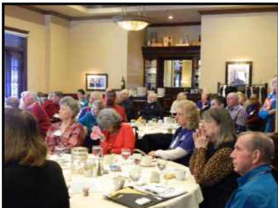
Over 100 attendees filled the conference rooms at Maggiano's Little Italy Restaurant.