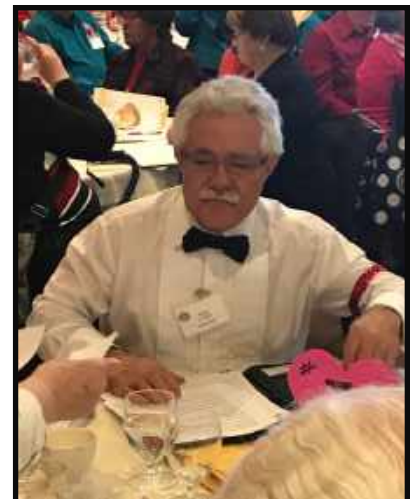
Gov Tony participated in Round table discussions on developing 'elevator speeches.'