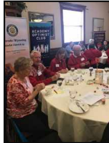
Conference attendees came dressed for Valentines Day theme