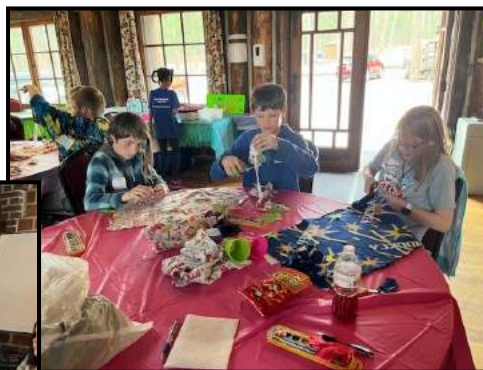
Cat Toy Project