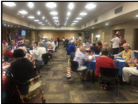
Almost 100 participants