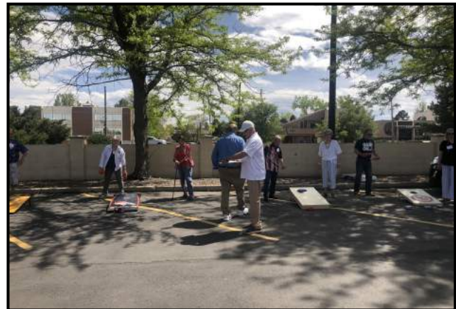
Days Grand Finale was Corn Hole tournament to determine who represents the district at OI Tournament in Reno