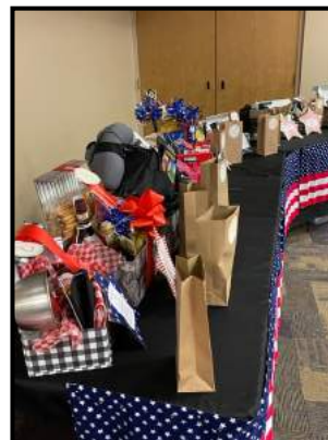
Fundraiser—prize box raffle