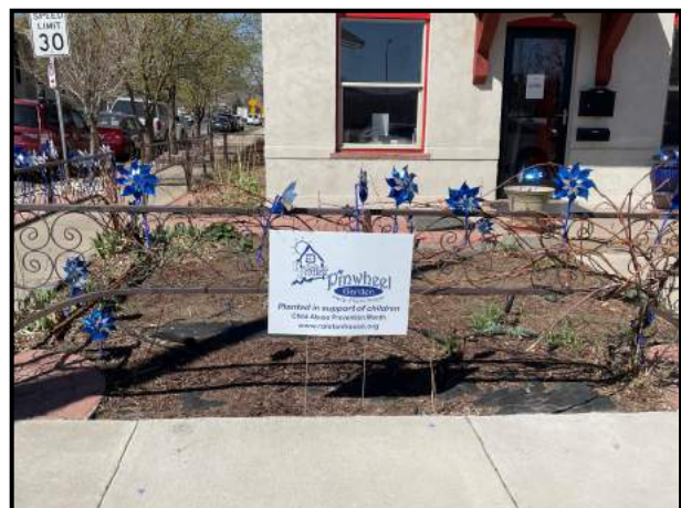
The pinwheel garden to prevent child abuse at our Optimist member Jim Carroll's office in Old Town Arvada.