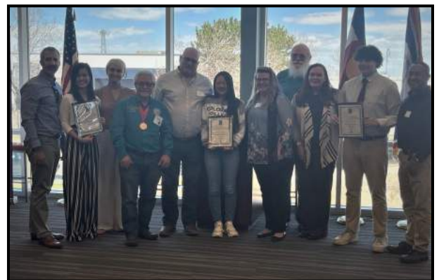
Group picture of winners with their parents. There was tremendous show of support for these kids from their families.