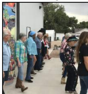
Some brave 'soles' learning how to line dance!